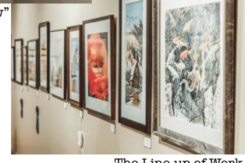
The Line-up of Work