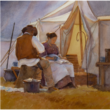
Seeking the Light