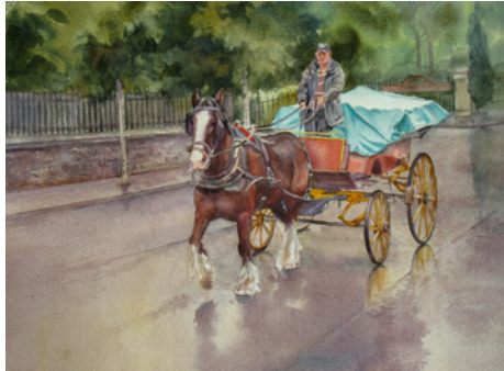
A Rainy Day Jaunt