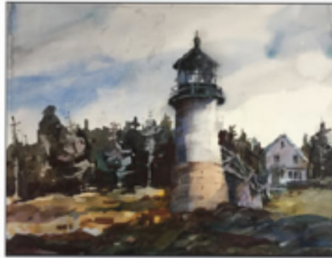
2017 Best of Show, by Whit Todd