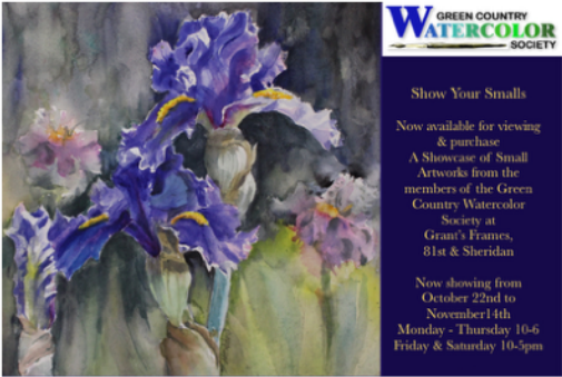
SHOW YOUR SMALLS AT GRANT'S FRAMES