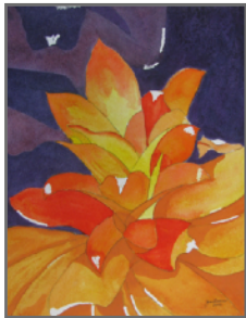
Honorable Mention Jim Owens