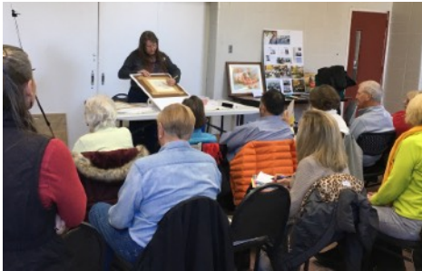
FEBRUARY MEETING PROGRAM BY JO LYNCH