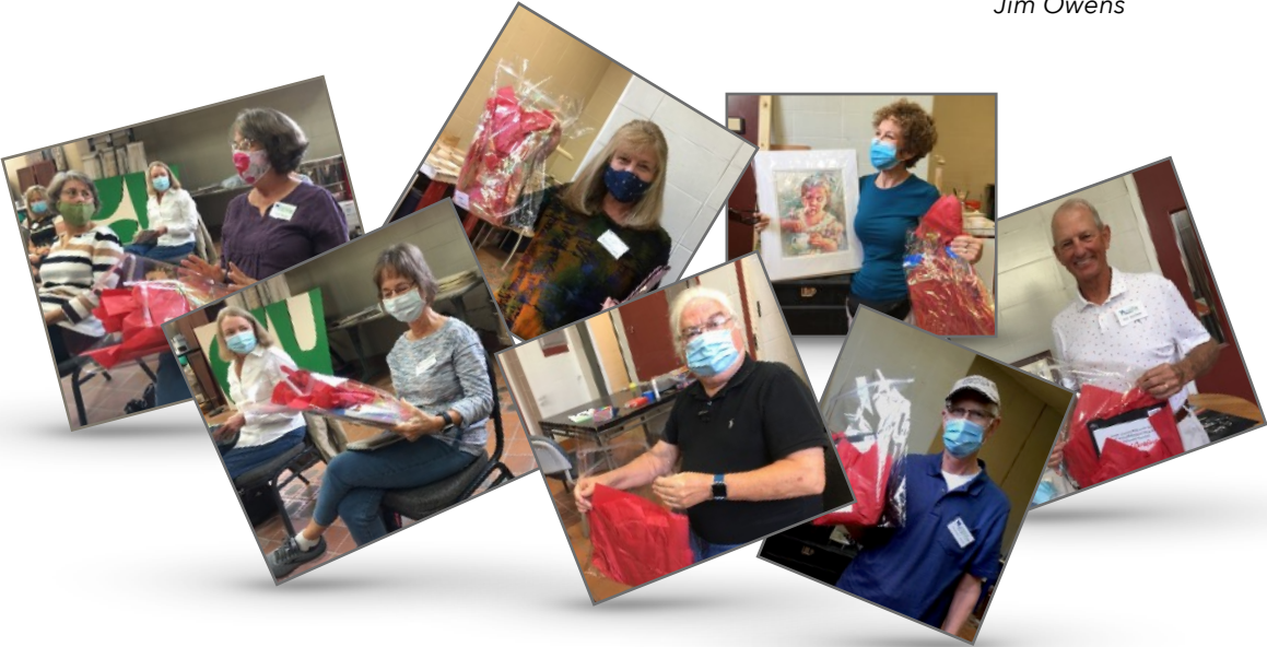
ANNUAL MEMBER'S EXHIBIT WINNERS RECEIVED AWARDS AT OCTOBER MEETING.