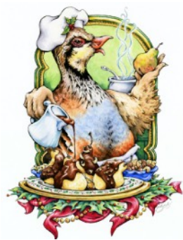
HONORABLE MENTION "PARTRIDGE & PEARS" - JO LYNCH