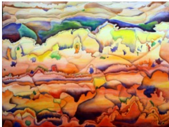
3RD PLACE "FANTASY" - JUDY GREGG