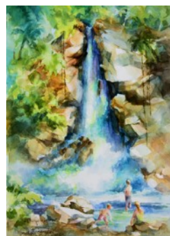
HONORABLE MENTION "RAINFOREST" - TERRI NEIL