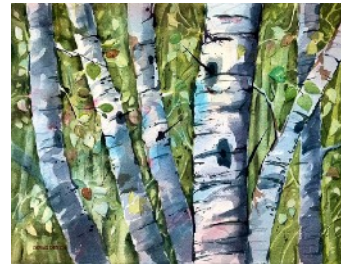
2ND PLACE "ASPEN GROVE" - DENNIS CROUCH