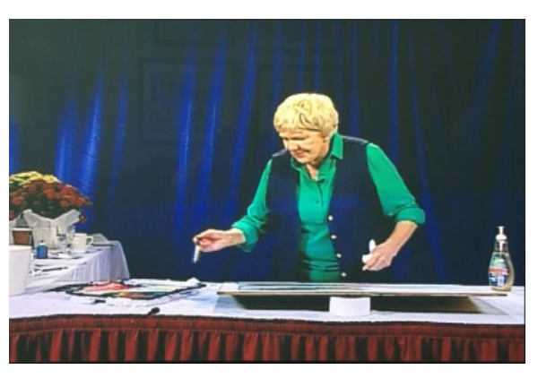
Painting by Jim Buchan

aselection of non-staining pigments. After stretching her paper and applying masking, she floods her paper with water in preparation for her washes. Jim highlighted a few snipets of her DVD entitled Nita Engle's "Action Watercolor" From Freedom to Control .