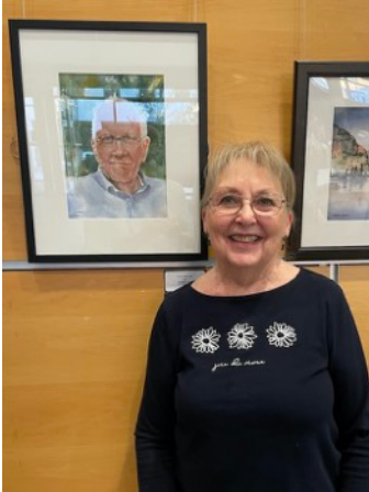
2nd Place — It's a Good Day by Jeanette Hooks