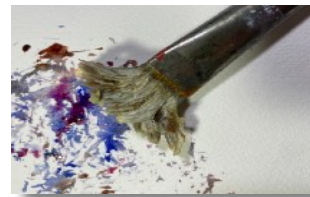
"Hairy." Old paint brush with bristles mangled. Great for all kinds of textures.