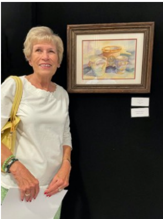
Honorable Mention — Pots of Italy by Virginia Hays