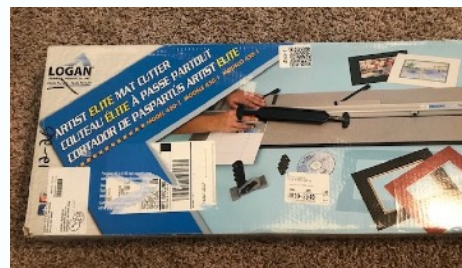
Artist Elite Mat Cutter. Original box, 2 cutting blades, stops and guides. $175.00.