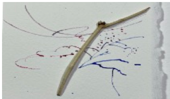
The Twig. Great for thin lines, stippling, and applying liquid frisket.

We all depend on our fine-quality watercolor brushes and tools. Sable, synthetic, camel, squirrel, goat, hog, round, flat, filbert, fan, mop, rigger, small, medium, large, and on and on it goes. The brushes and tools we always reach for, the ones we depend on, will always be our best friends. However, many artists discover that making their own tools is not only enjoyable but also some of the best additions to their toolbox. Here are three self-made tools that I utilize in most of my paintings. -DC