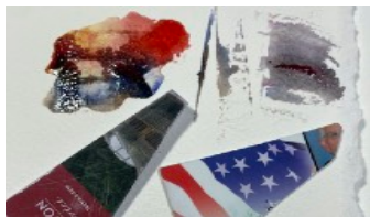
Plastic Card. Scraping, stamping, and smearing textures.