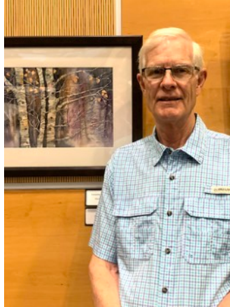
3rd Place — Enchanted Aspen Grove by Dennis Crouch