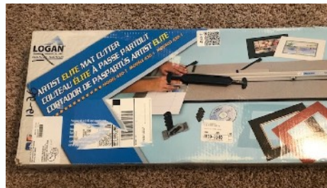
Artist Elite Mat Cutter. Original box, 2 cutting blades, stops and guides. $175.00. DeDe Burgess