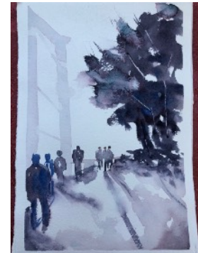
This pic is an exercise of shapes and people.

so much so that I was compelled to look him up online. Well, after a bit of looking around, I saw that he had a workshop coming up in Little Rock, just a few miles from where my sister lives! I considered that a sign from the universe, so I immediately registered and got the last spot. I'm so glad I did, it was a great workshop, and I had a good visit with my sister, too!