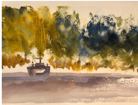
This is the follow-the-leader exercise where we didn't know what we were painting. We just painted the shapes as he did. It was fun.