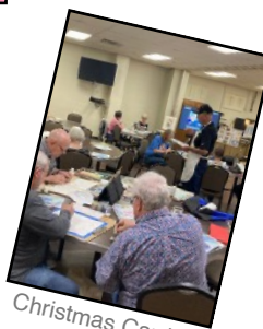
Christmas Cards - November