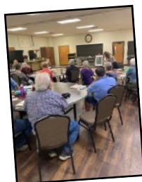
Show and Tell - October