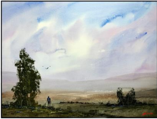
Painting by Posey Gaines – Best of Show 2023