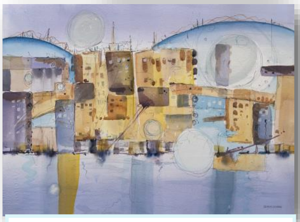
2ND PLACE— BY DENNIS CROUCH