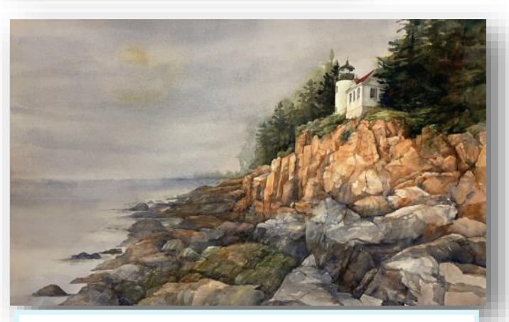
3RD PLACE — BY AMY JENKINS