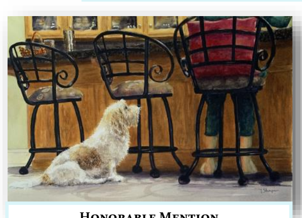
HONORABLE MENTION BY TOM SHUPE