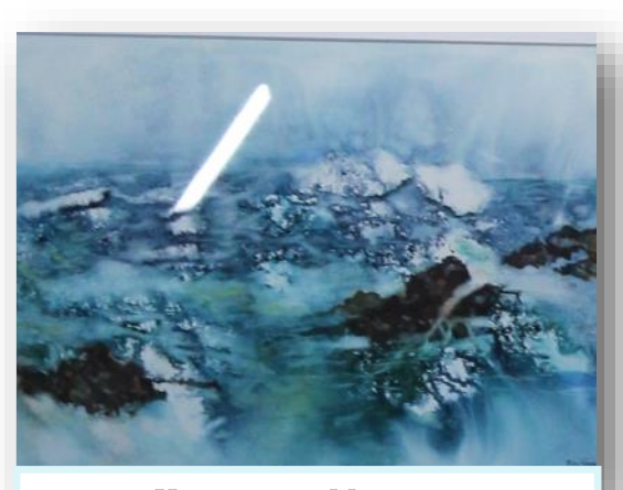
HONORABLE MENTION BY KAY HAYS