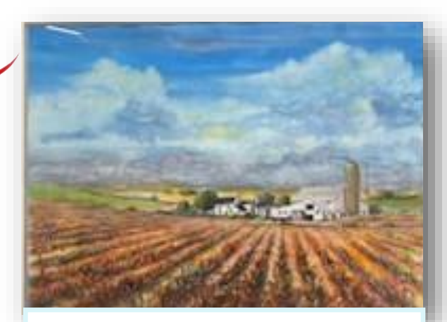
HONORABLE MENTION BY JERRY WADE