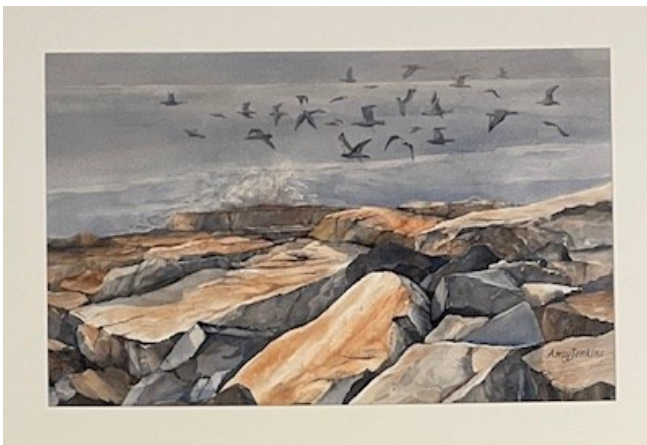
Amy's "Untamed Seacoast" was juried into the Watercolor USA 2024.