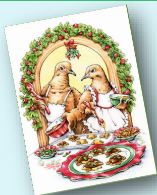
Above pic is Jo Lynch's — Best of Show 2024