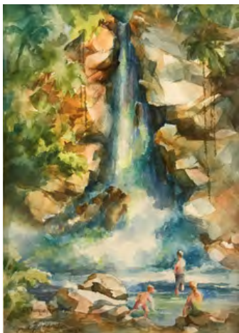
Honorable mention award for el yunque water fall