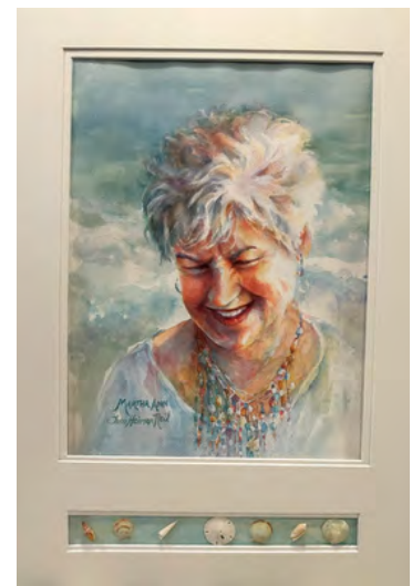
Terri's 90 year old mother at the beach